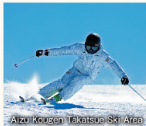
Aizu Kougen Takatsue Ski Area