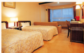
[Aizu Kougen Hotel]

The lobby atrium and the fire in the mantelpiece create a romantic atmosphere.