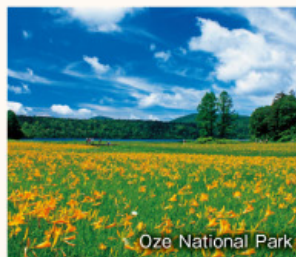
Oze National Park